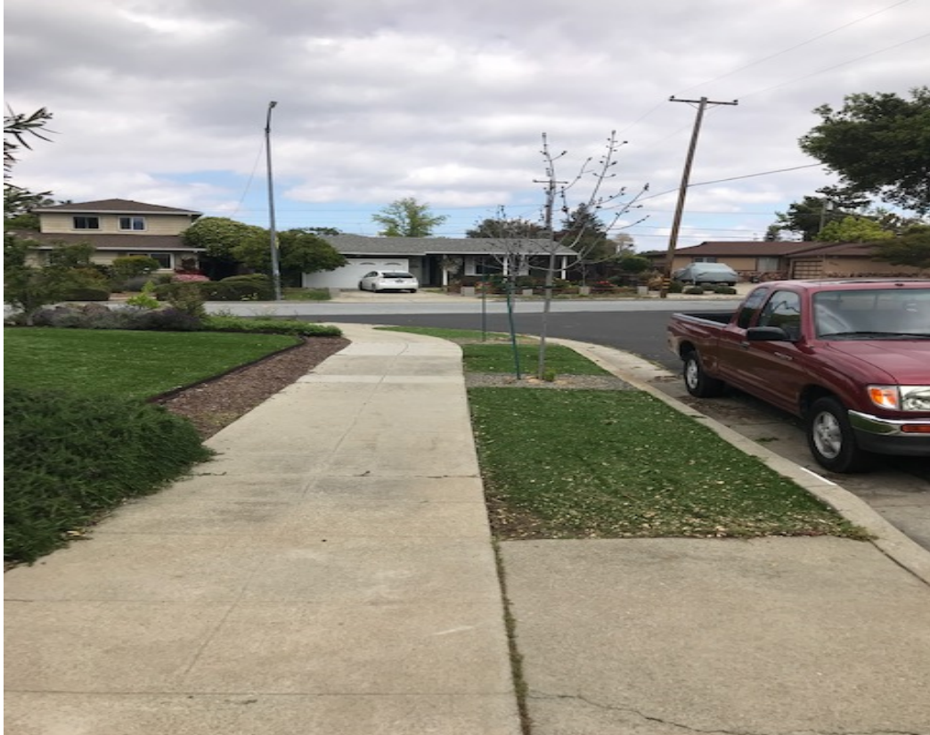
1) Street View Left

Latitude: 39.922047 / Longitude: 77.850632 - Timestamp: 2020-04-15 10:40:30