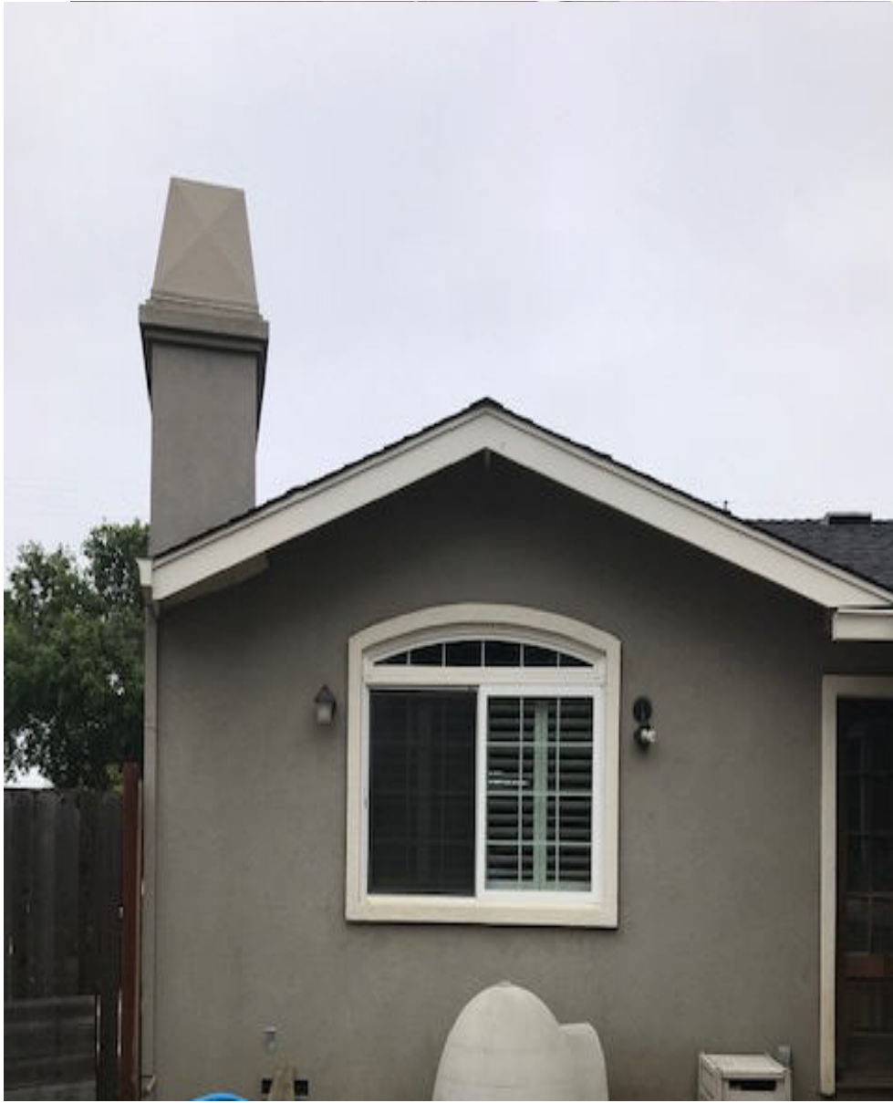
5) Rear View Left

Latitude: 39.922085 / Longitude: 77.850639 - Timestamp: 2020-04-15 10:45:50